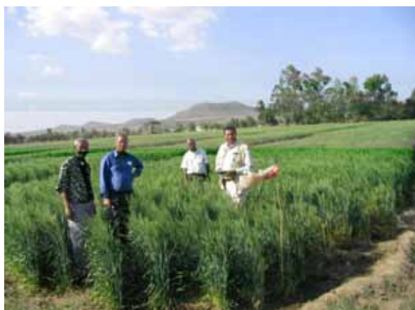
Stem rust resistant wheat variety (ETBW4921) under off-season multiplication at MARC, Ethiopia

locations in partnership with the Ethiopian Institute of Agricultural Research (EIAR) and found to be stem rust resistant in Ethiopia. In order to ensure availability of seed upon the release of these promising lines ICARDA supported off-season seed multiplication. ETBW 4919 and ETBW4921 were planted under irrigation on 6 and 12 ha, respectively at Melkasa Agricultural Research Center in 2007.