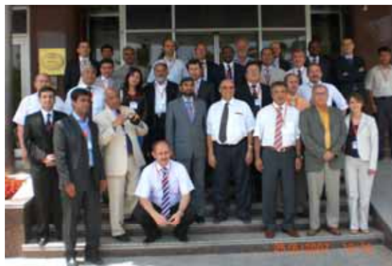
Participants of the ECO Regional Training Course on Seed Marketing and Promotion in Istanbul, Turkey

At the end, the panel of resource persons presented their views on the workshop and issues that emerged from discussions. Specifically underlined were the issues of partnership development between governments and the private sector, the need to form and strengthen a regional seed association in the ECO countries, identification of appropriate channels for dialogue with policy makers, and assistance required by some countries to define and implement seed sector strategies. It was concluded that some of these issues could form the agenda for further discussion in the upcoming international seed trade conference which will include technical staff, private sector, and policy makers.