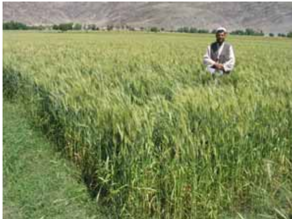
Wheat seed production by member of Besboud VBSE in Nangarhar province