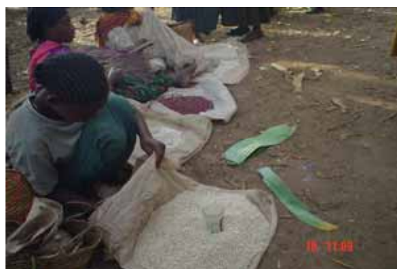
Beans in local market used as source of grain or seed