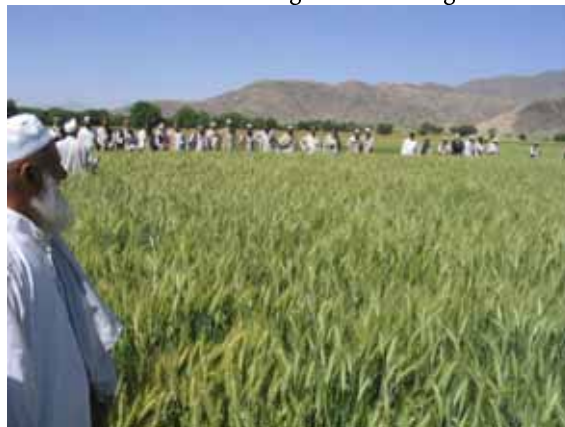
Participants of the seed production technology course during a practical session

All lectures were complemented by practical sessions and discussions in the field and laboratory. VBSE members visited seed production fields where variety identification, rouging and field inspection procedures were demonstrated and practicals exercised. During a visit to seed testing laboratory procedures for sampling and quality testing for physical purity and germination were demonstrated. The purpose is to create awareness of the linkages between seed production and quality assurance and its practical implementation. Farmers were clearly aware of 'quality' issues in seed production and expressed their commitment in meeting the challenges.