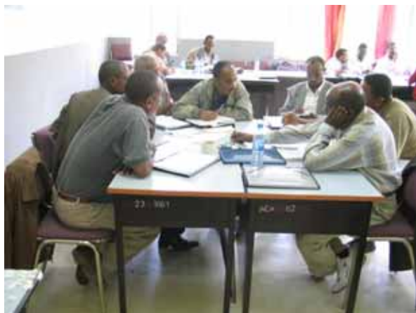
Participants during group work at the regional seed workshop at Awasa, Ethiopia

Resource persons from WI, ICARDA, ASARECA, ESE and SARI facilitated the national and regional workshops.