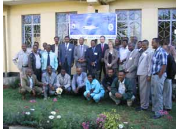
Participants of the national seed workshop in Addis Ababa, Ethiopia

presentation during the regional seed workshops to a broad range of stakeholders, who assured their commitment in implementing the findings.