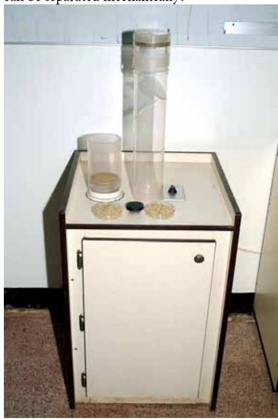
Seed blower showing heavy(left) and light (right) fraction

through the working sample, lifts up light contaminants such as empty florets, chaff, immature and shriveled seeds, and drops them into the cavities located under the top rotating lid for collecting light impurities. If the blower is calibrated well using standard samples (e.g. ISTA calibration samples) the lifted portion represents the lighter impurities whereas the portion, which is not lifted by air current, represents the pure seed fraction, other seeds and heavy impurities, if any, and can be separated mechanically.