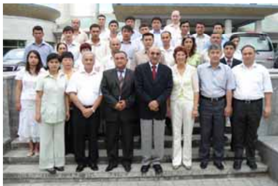
Participants of the seed quality assurance course in Tashkent, Uzbekistan

The participants were presented with theoretical and practical aspects of seed quality assurance and ISTA accreditation. The course covered the theory and practical aspects of purity, germination and tetrazolium test and the use of ISTA handbooks and Rules. Mrs Anny van Pijlen and Dr Aziz Nurbekov delivered the lectures and organized practicals. The skills acquired will help the participants implement an effective seed quality assurance and increase the efficiency in maintaining the desired seed quality attributes according to ISTA rules.